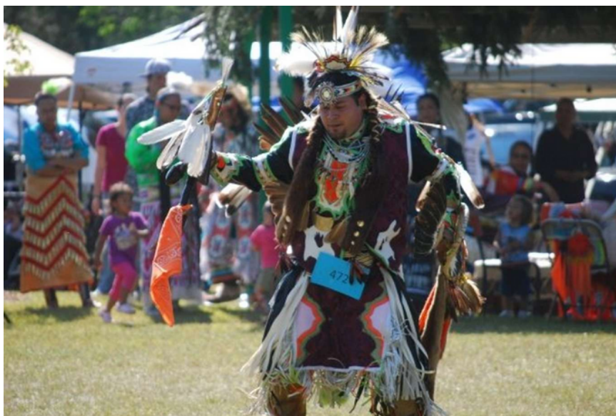
A dancer performs at the Delaware Nation Pow Wow.