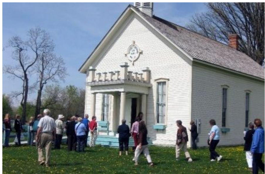
School house at Buxton National Historic Site

For a full schedule of the 100th Buxton Homecoming, click here.